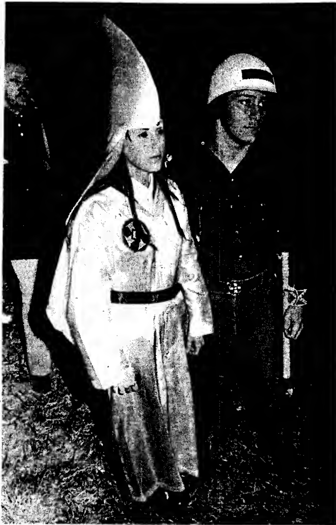
Young Klan couple